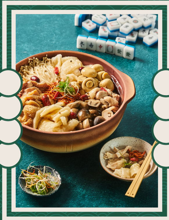
Double Boiled Peppery Soup with Fish Maw, Pork Treasure Bag & Fungi